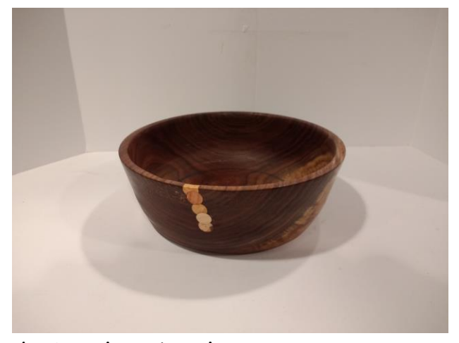
Mark Fields made 2 walnut bowls