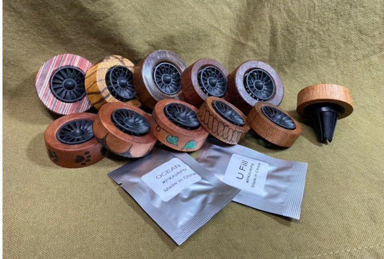
Lynda Zibbideo made rings and air fresheners.