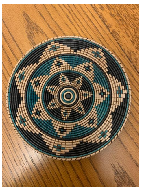
David Steel - Basketweave illusion